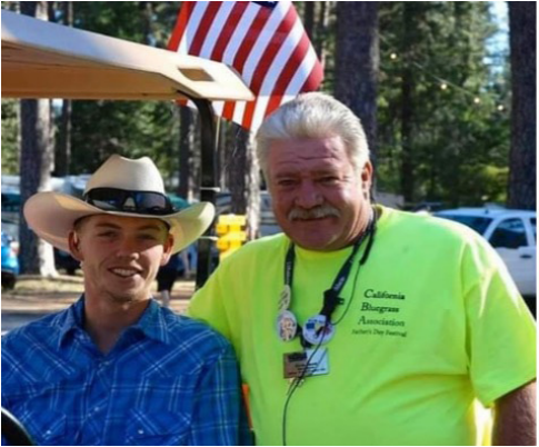
Written by Editor