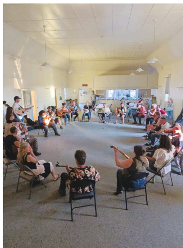
Group class at the Folk Farm.