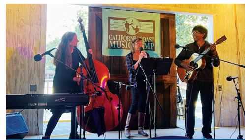
CALIFORNIA COAST MUSIC CAMP