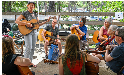
CBA SUMMER MUSIC CAMP