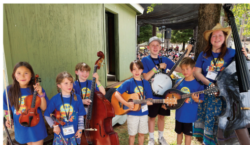
CBA YOUTH ACADEMY