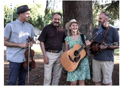
Silver City, in concert July 10.