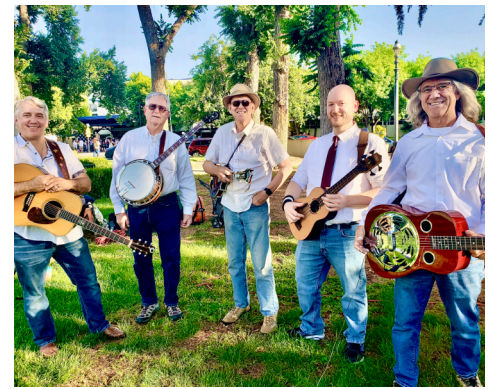
Sycamore Bend, in concert May 8.