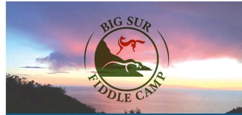
BIG SUR FIDDLE CAMP