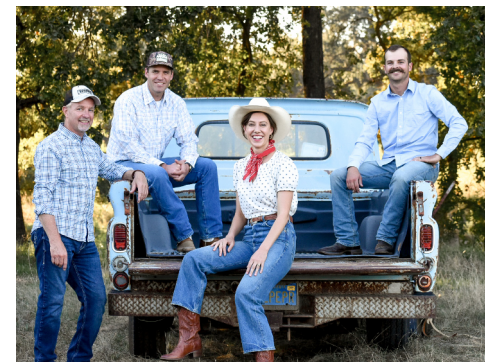
The Kings River Boys, in concert June 26.