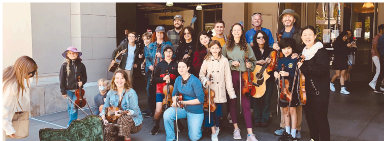
A class of Manning Music buskers seen in the wild.