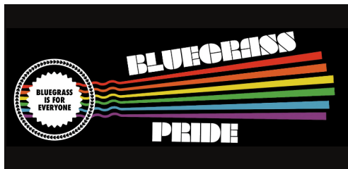
CAMP BLUEGRASS PRIDE