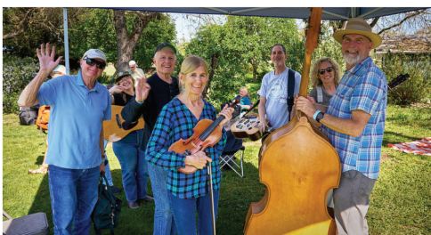
Jam at Sonoma.

Friends, neighbors, pickers, grinners, and all you lonesome souls with a mandolin in the closet—are you looking for a jam to bring out that banjo, rosin up that bow, dust off that guitar, or just sit in the circle and soak up the sound? Then point your