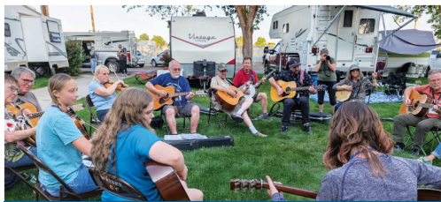
IDAHO BLUEGRASS CAMP