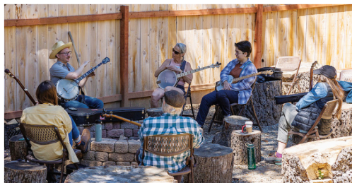
CBA JULIAN FAMILY FIDDLE CAMP

Along with jams and community music schools, music camps are a great way to improve your chops and meet more kindred musical spirits! Check out the CBA's camps—and the many bluegrass, old-time, and related music camps up and down the West Coast over the rest of 2026!