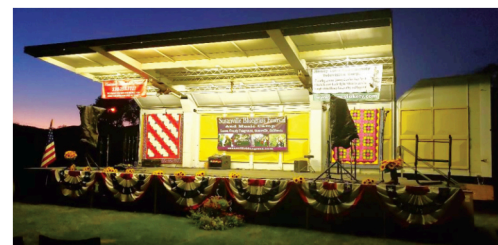
SUSANVILLE MUSIC CAMP